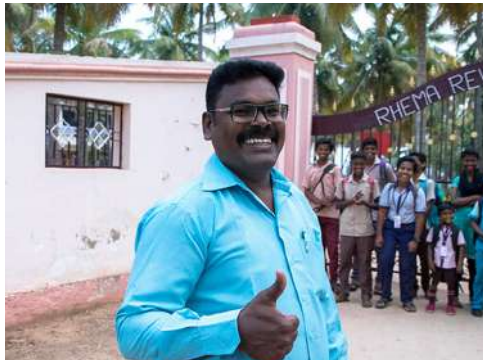
bus driving heroes