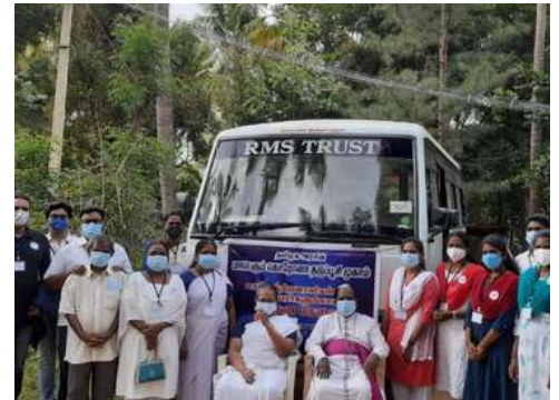
all round heroes